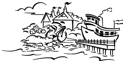
Coronado Ferry Landing