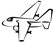
North Island Naval Air Station